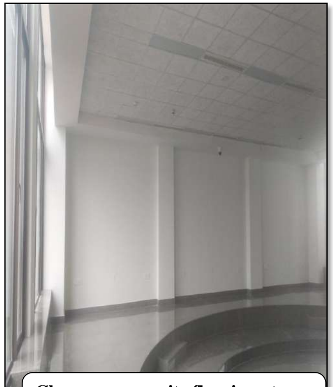
Class room granite flooring at MDC Block