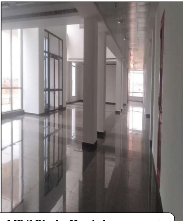
MDC Block Handed over except Lift and GF kitchen