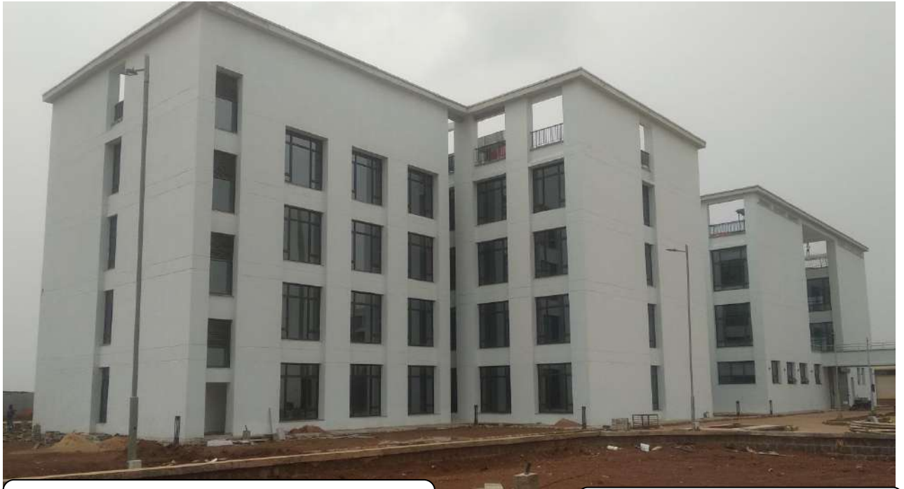
Outside view of MDC Block