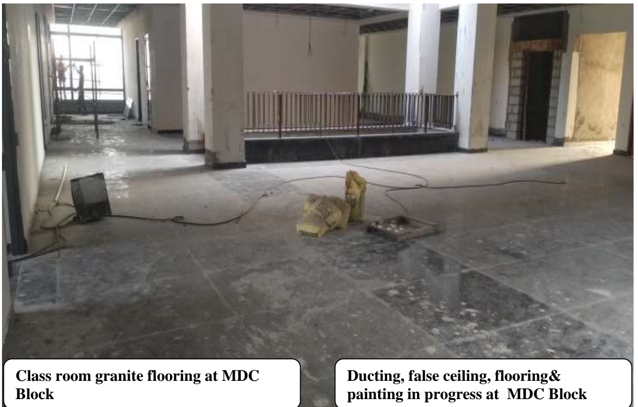
Class room granite flooring at MDC Block