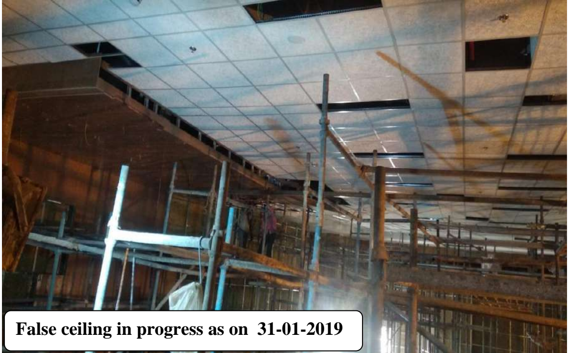
False ceiling in progress as on 31-01-2019