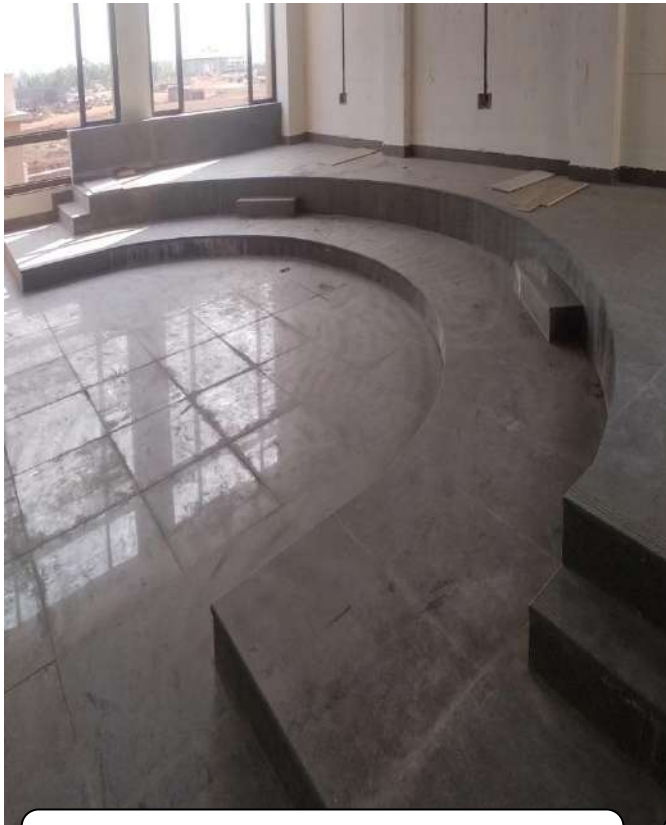
Class room granite flooring at MDC Block