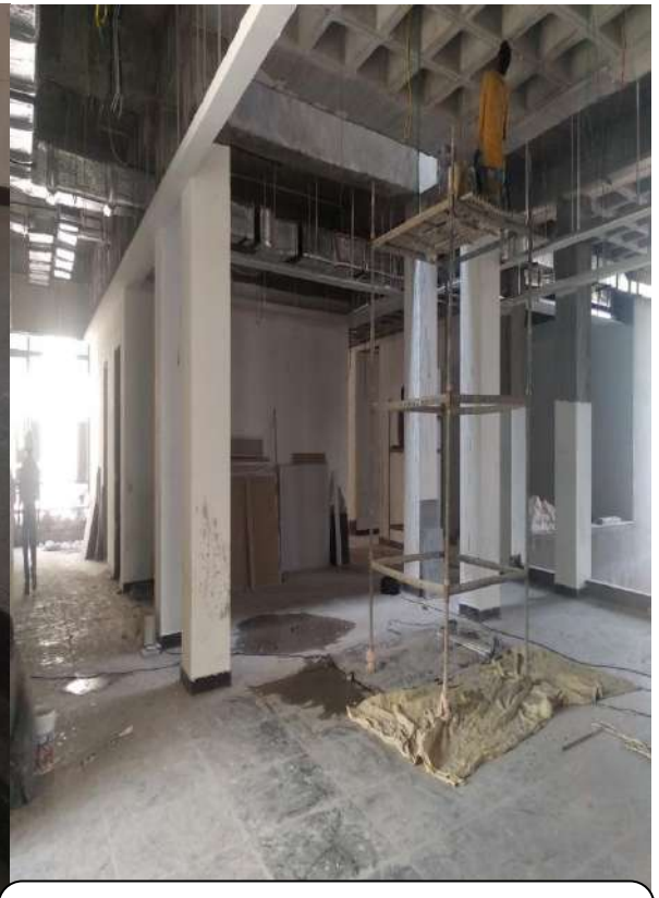
Ducting, false ceiling, flooring & painting in progress at MDC Block