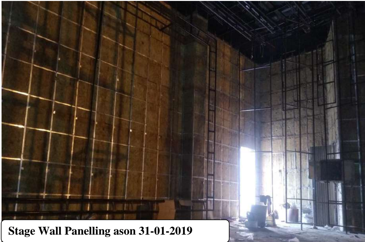
Stage Wall Panelling as on 31-01-2019