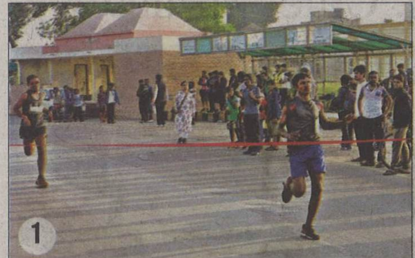
M Staff Reporter RAIPUR, Nov 19

INDIAN Institute of Management (IIM) Raipur successfully organised the second edition of its flagship Marathon event Prayaas 2.0 on Sunday. The event kicked off from the environs of Marine Drive, Telibandha with more than 2500 registered runners. The theme for the run this year was 'Beti Bachao, Beti Padhao' with the objective to create awareness regarding the importance of equal rights and opportunities for the girl child.