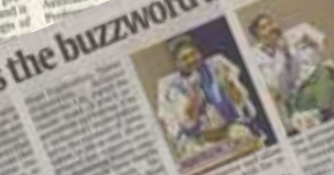
Participants during the 4th HR Summit at IIM Raipur.