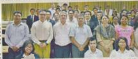
Participants during the Hindi Diwas celebrations at IIM-Raipur.