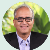
Dr. Devi Shetty Chairman & Executive Director, Narayana Health Limited