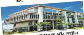
छात्र आदान-प्रदान पहल और नवीन शैक्षिक कार्यक्रमों का विकास शामिल

नवभारत व्यूरो। रायपुर। आईआईएम रायपुर और यूनिवर्सिटी ऑफ वूल्वर हैम्टन ने एक रणनीतिक रूप से तैयार किए गए एमओयू पर हस्ताक्षर कर साझेदारी को औपचारिक रूप से स्थापित किया। यह समझौता शैक्षणिक सहयोग को सुदृढ़ करने, अनुसंधान पहलों को